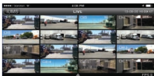
Viewer for iOS