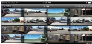
Viewer for iOS